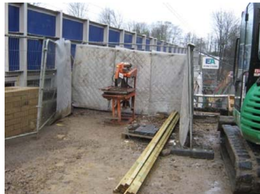
Figure 2 Noise screening of stationary plant.

Noise reduction actions in turn have contributed significantly to rapid turnaround times for Section 61 applications, and positive relationships with local councils. Where complaints were received, examples of how noise reduction measures were implemented on site have positively reassured neighbours that BCM and Network Rail are doing the best they can to reduce noise from construction works, especially when working at night.