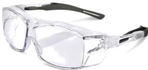
OTG Safety Glasses H60 ERGO Temple Cover Spectacles

Anti-scratch coating - The anti-scratch coating acts as a shield that improves the resistance of lenses and reduces the formation of scratches. It lengthens the life of the lens and improves